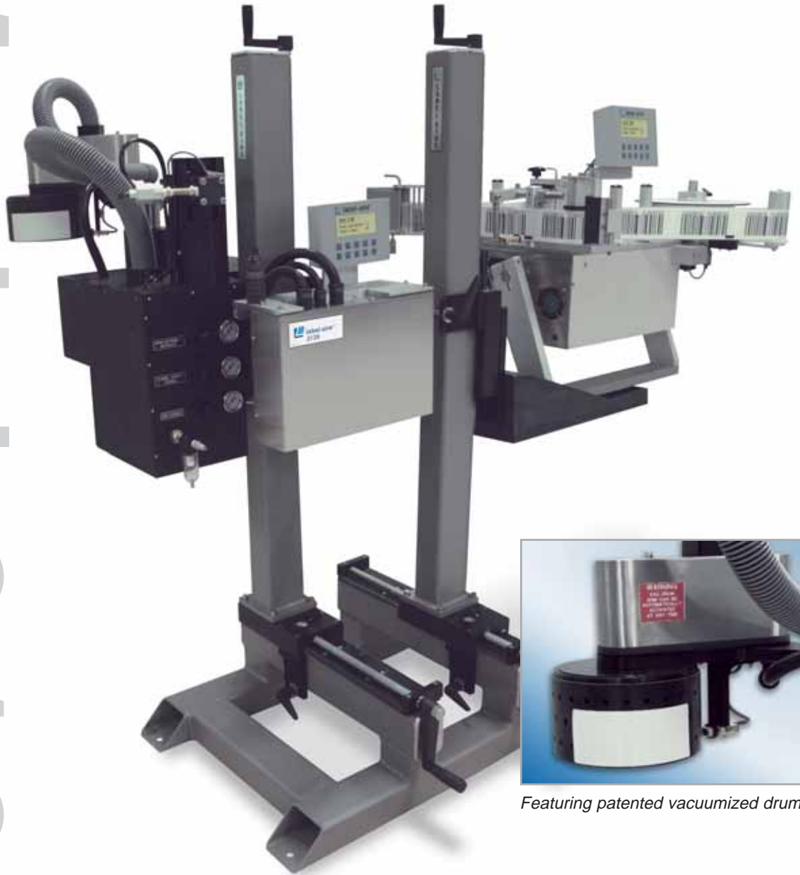
Featuring patented vacuumized drum