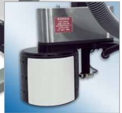
Featuring patented vacuumized drum