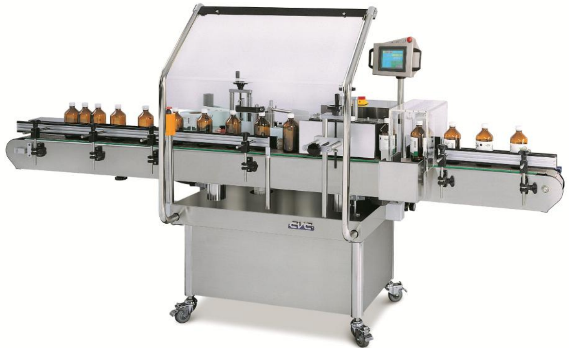
• Lot/ Date Inspection