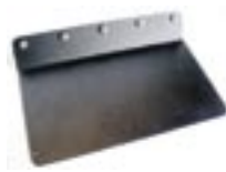
Keyboard Tray Bracket