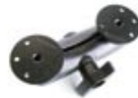
Rotational Ram Ball Assembly