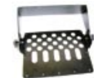
Top Mount Swing Arm Bracket & Computer Back Plate