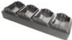
4 Slot Lilon Battery Charger