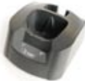
Single Slot Dock With Spare Battery Charger