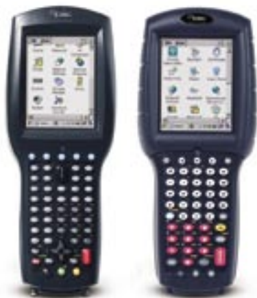
Falcon 4400 series computers are also available in non-handle versions.