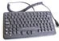
NEMA 4 5250 Keyboard