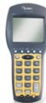
The Falcon® 335 is available with either a standard 38-key full alphanumeric or 25-key large numeric keypad

A batch model, the Falcon® 330 is also available.