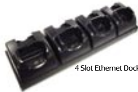
4 Slot Ethernet Dock