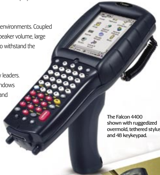
The Falcon 4400 shown with ruggedized overmold, tethered stylus and 48 key keypad.

Falcon® 4400 models with an integrated handle are ergonomically designed for scan-intensive applications. Non-handle models are contoured to fit comfortably in an operators hand for extended periods of fatigue-free data collection activities. The Falcon Management Utility and Falcon Desktop Utility are included with every unit providing remote management and configuration.