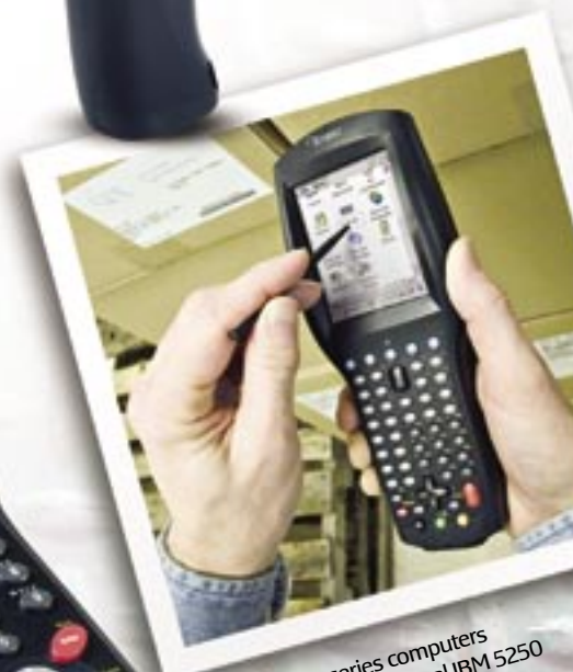
Falcon® 4400 series computers are available with optional IBM 5250 terminal emulation keypad.