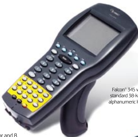
Falcon® 345 with standard 38-key alphanumeric keypad

Additional flexibility comes with the wireless connection of Falcon 345 terminals into an existing legacy system. The Falcon® 345 comes with a choice of 25, 38, and 48-key keypads. A batch model, the Falcon® 340 is also available.