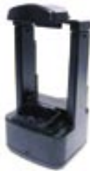
Vehicle Mount Dock & Charger