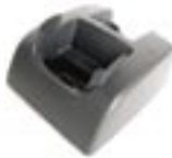
Single Slot Dock