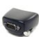
Serial Printer Adapter