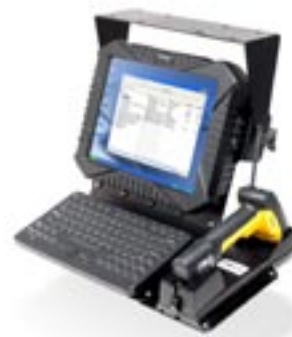
The Falcon® 4620 low profile mounting system features keyboard and PSC's PowerScan® RF handheld scanner