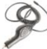
Car Charging Adaptor