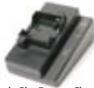
Single Slot Battery Charger