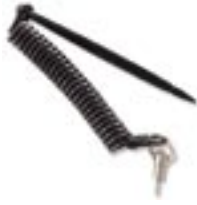
Tethered Stylus Kit