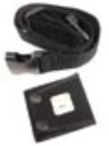
Belt & Clip for Holster