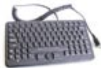
NEMA 4 Standard Keyboard