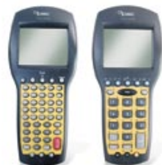
Keypad configurations available with the Falcon® 345