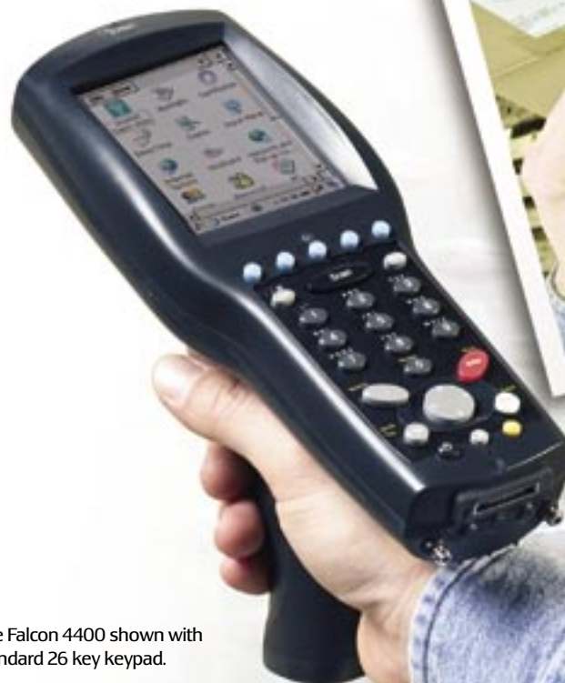
The Falcon 4400 shown with standard 26 key keypad.