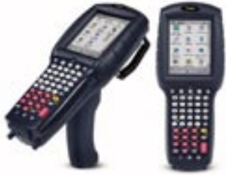
FALCON 4400 SERIES