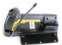
Scanner Tray Bracket