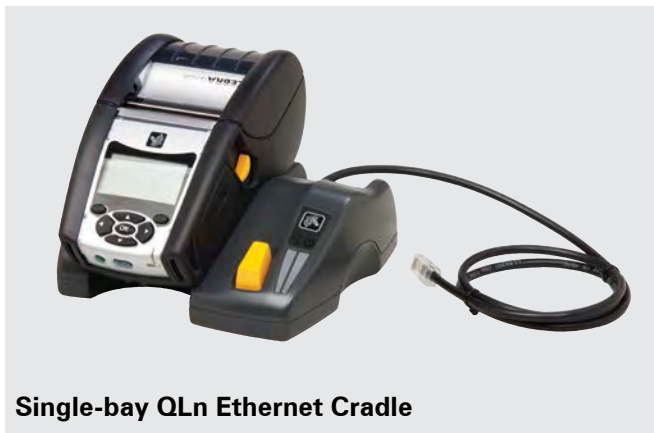
Single-bay QLn Ethernet Cradle