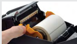
Intuitive peeler operation