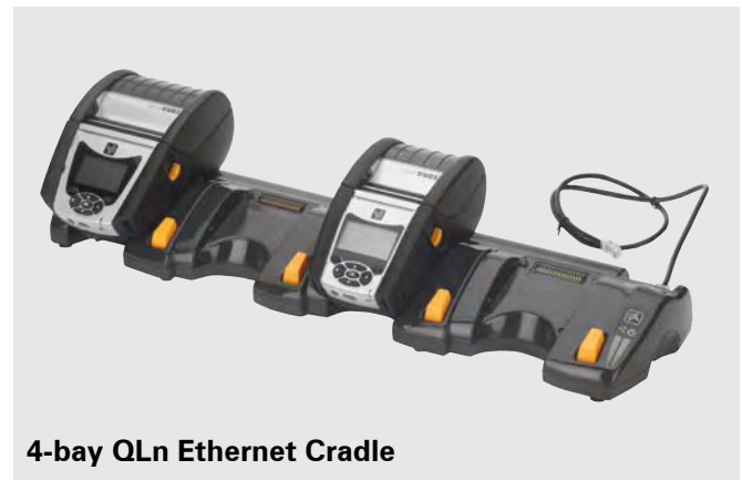
4-bay QLn Ethernet Cradle